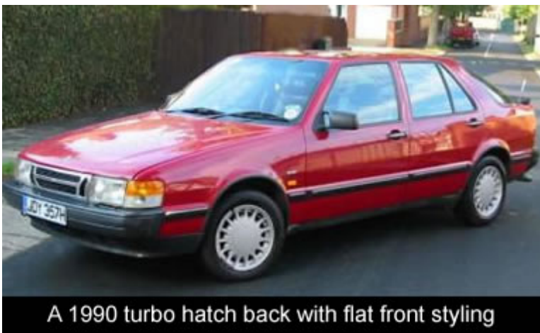
A 1990 turbo hatch back with flat front styling

SAAB management first began thinking about the design for an entirely new car in the 1970s but the same financial constraints that precluded development of a new engine delayed any serious design work. Of course, SAAB were not the only manufacturers concerned about the enormous costs associated with the design and introduction of new models and eventually this resulted in a quadripartite alliance of makers in a venture that became known as the Type 4 project.