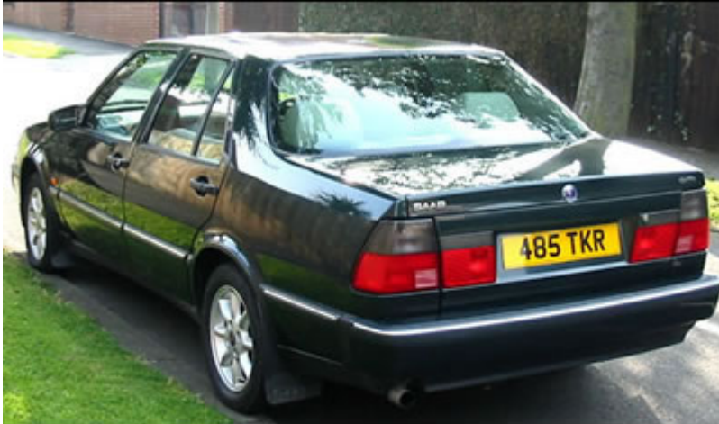
One of the last 2.3 Griffins made. This fine 1997 example was a particular favourite of the author's brother. Note non standard Anniversary wheels!

transpired, although the car itself was a very relaxed and competent cruiser. Fuel consumption was surprisingly good but the author feels that this is because the big, lazy engine seldom breaks into a sweat. Irrespective of use, the author managed to return 28mpg even on short, town journeys.