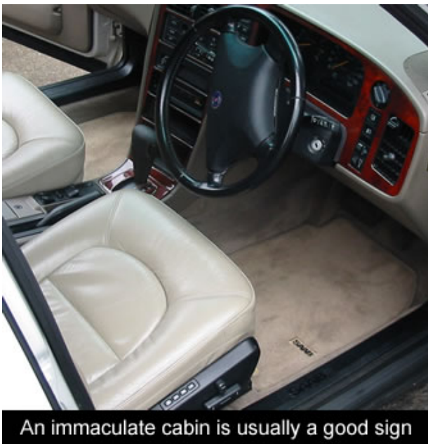
An immaculate cabin is usually a good sign

With a bewildering choice of models and engines, deciding which model to choose is anything but easy. The obvious choice is for a full blown Aero or 200bhp Anniversary but such machines do not come cheap and (with the former) running costs and increased insurance premiums must be factored in. Griffin models with all the optional equipment as standard make a lot of sense... if you can find them! Bear in mind that full pressure 2.3 turbo cars seem much less plentiful after 1994 and are correspondingly more expensive.