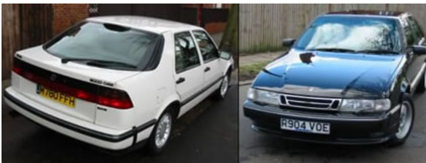
Two views showing the CS styling to good effect: on the left a 1994 V6 and a late 1997 2.3 (200bhp)CSE turbo (right)

The hatchback received a major makeover for the 1992 model year with an entirely new front end, including different wings, bonnet, grille, lights and bumper. At the back of the car, the rear quarters lost their quarter glasses, whilst a revised tailgate, back lights and bumper completed the transformation.