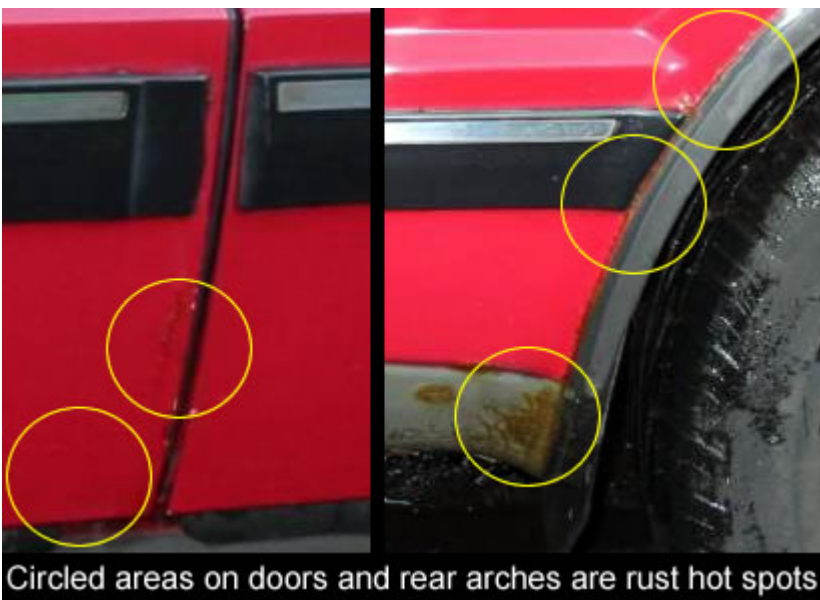
Circled areas on doors and rear arches are rust hot spots

The 9000 range when new was held in high regard as an executive model from a prestige car maker. As such, the 9000 can be fitted with a host of complex optional equipment. Many cars will have been subject to loving care and sympathetic driving but others will have been soundly thrashed. Sorting the tired cars from better examples may seem daunting but need not be as difficult as expected, even for the novice.