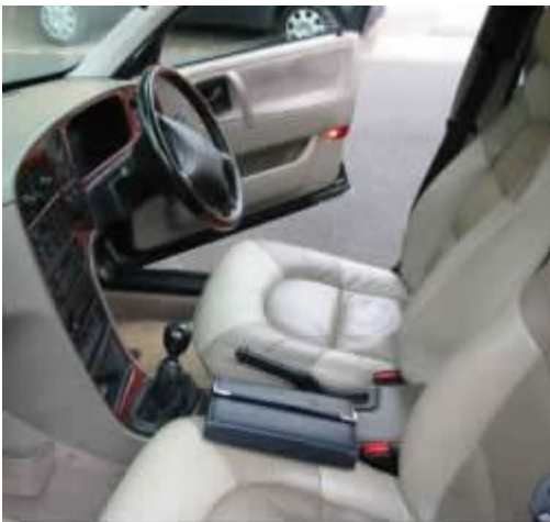
Alpaca/sand beige Annivesary trim

The range's swansong was the Anniversary, so named because it coincided with the maker's 50th Anniversary. Engine options remained unchanged, with cars being offered with either of the light pressure (LPT) engines rated at 150 and 170 bhp respectively or the 2.3 FPT (200bhp). Smart new 8 spoke alloys complimented the Aero style body-kit that included colour coded wrap around bumper covers, sill extensions, front and rear spoilers and wheel arch mouldings. The side mouldings on the doors and front wings had black as opposed to the normal chrome effect inserts, in common with the Aero.