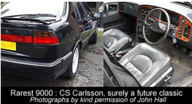
Rarest 9000 : CS Carlsson, surely a future classic

appears in the driver's door card became standard with the new models. Air bags started to appear in steering wheels soon after, though not all cars had them as standard. These new shape hatches were offered in CS (standard trim) and CSE guise. Engine choices were as before but gearboxes were revised for a slicker change and different ratios about this time.