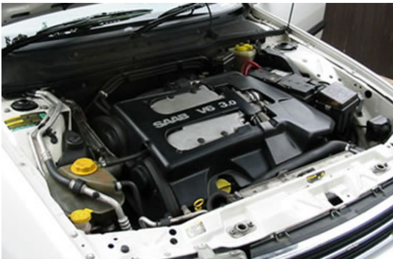
V6 9000: keep on top of cambelt & tensioner changes

Manual gearboxes sometimes prove troublesome too – beware of difficulty in selecting reverse gear (1994 on cars in particular) and general noise (all years). Cars with tired clutches are not cheap to fix, (a main agent will probably charge around £750+VAT) as the clutch slave cylinder is positioned inside the gearbox and should always be renewed with the clutch plates. It is worthwhile checking vendors have not left tins of brake fluid in the luggage boot and a glance under the gearbox for damp patches is worthwhile, as fluid leaks can escape from the rubber plugs in the gearbox base.