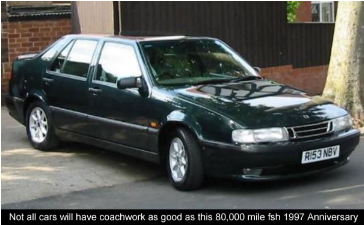
Not all cars will have coachwork as good as this 80,000 mile fsh 1997 Anniversary

Manual gearboxes sometimes prove troublesome too – beware of difficulty in selecting reverse gear (1994 on cars in particular) and general noise (all years). Cars with tired clutches are not cheap to fix, (a main agent will probably charge around £750+VAT) as the clutch slave cylinder is positioned inside the gearbox and should always be renewed with the clutch plates. It is worthwhile checking vendors have not left tins of brake fluid in the luggage boot and a glance under the gearbox for damp patches is worthwhile, as fluid leaks can escape from the rubber plugs in the gearbox base.