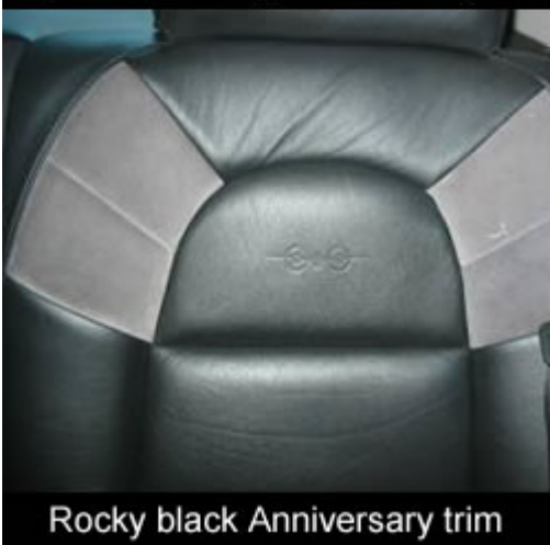
Rocky black Anniversary trim

A special steering wheel with wood inserts gave the cars a special feel whilst leather seat facings in either rocky black (with suede inserts) or sand beige (with alpaca inserts) were standard, along with textile over mats. Reflecting the maker's aviation connection, seat backrests were embossed with the SAAB aeroplane logo. Colour choice was restricted to Black, Scarabe green, Midnight blue, Amethyst violet or Imola red. Some very late 2.3 Anniversary models were fitted with 16" Super Aero wheels (with exposed lug bolts and a centre badge). These cars tended not to have the special Aero leather steering wheel with wood inserts.